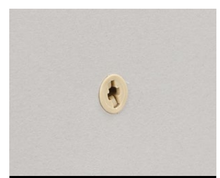
Insert supplied anchors into the wall.