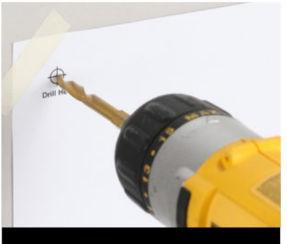
Drill with a 1/4" diameter cobalt drill bit.