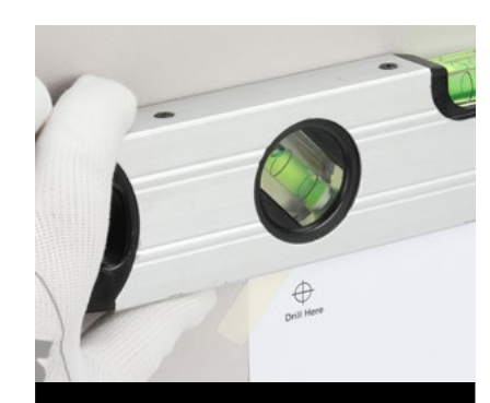
Place template on wall with tape. Make sure that template is level. Mark the hole locations.