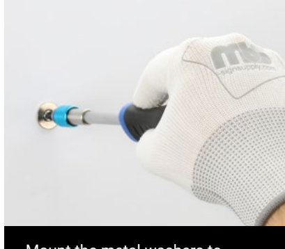
Mount the metal washers to the wall.